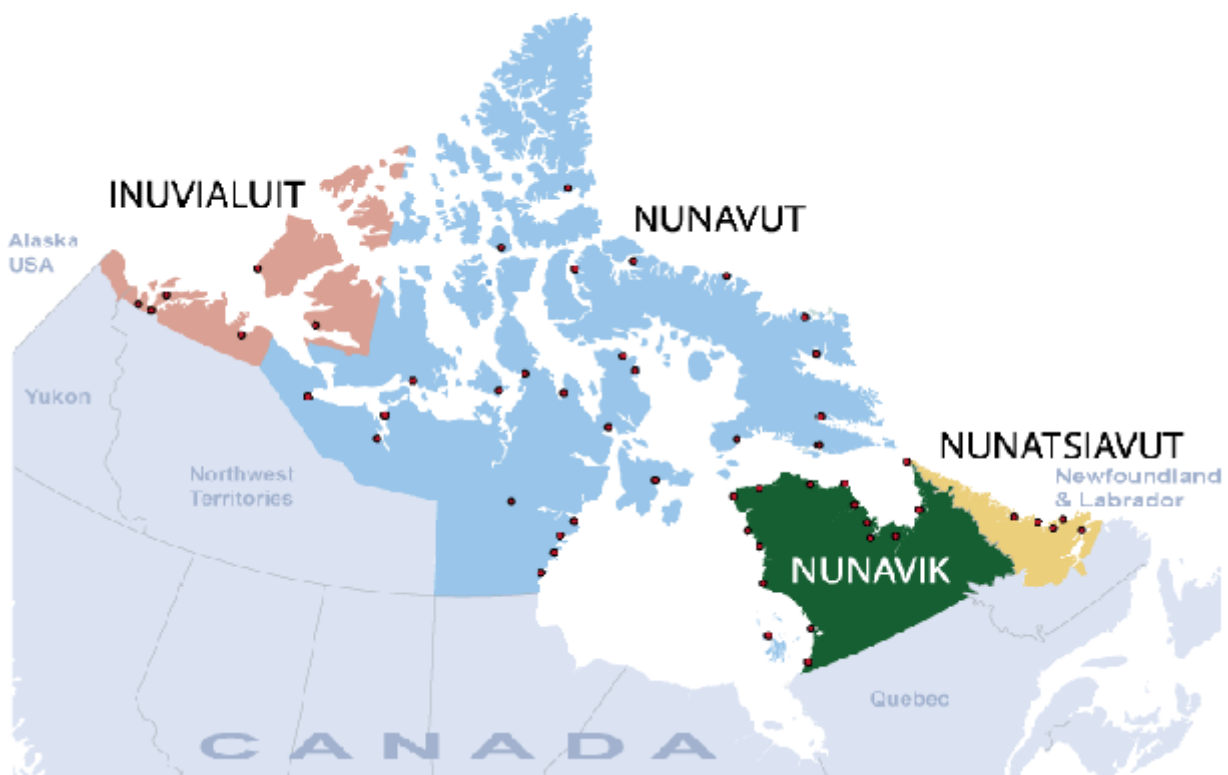
Map 1 Inuit Regions in Canada

In 2001, nearly three-quarters (72%) of Inuit lived in the north of Canada, primarily in coastal communities not accessible by road, and were concentrated in four main regions established through the settlement of land claims agreements: the northern coastal region of Labrador (the Nunatsiavut region), northern Québec along Hudson and Ungava Bay (in the area known as Nunavik), the territory of Nunavut and the northwestern corner of the Northwest Territories (also known as the Inuvialuit region). These regions are shown in the following map.